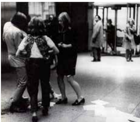
Guerilla Art Action Group, Call for the immediate resignation of all Rockefeller from the Board of Trustees of MOMA , 1969

Through the Forum, business sponsors' senior management - not the PR, community or corporate sponsorship staff - were required to engage in watching the performance, and then meet with the artists, directors, students and others in a closed session after the show. They were there to discuss the art as equals, in the spirit of mutuality, but also discuss the relation of sponsoring business to the art that had been sponsored. The key aim was mutual learning, to dissolve barriers between the sponsor, the artists and the work. This method made it impossible for the individuals representing the sponsor not to be implicated in the aesthetics, the issues, the economics and politics of the work sponsored, and vice versa. Due to the nature of the theatre groups involved, these conversations were often remarkable and transformatory for the individuals involved.