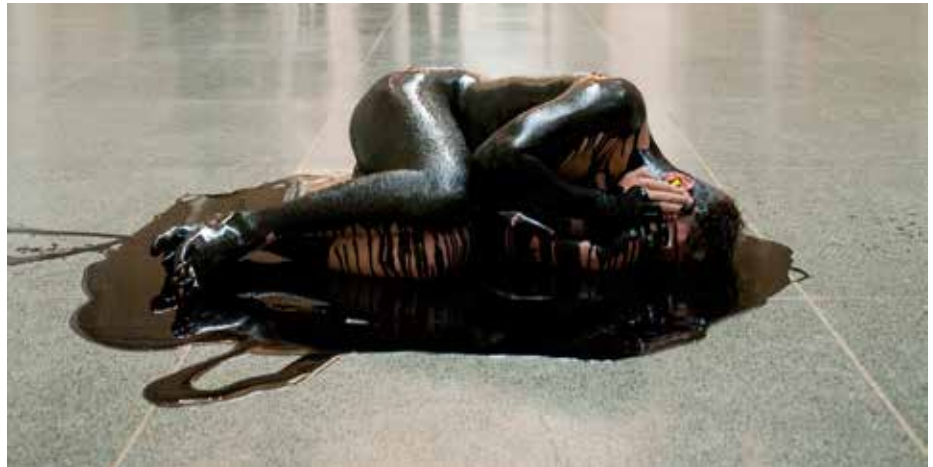
Liberate Tate, Human Cost , 2011, Photo: Amy Scaife

The Study Room Guide ends with this particular publication for a reason. I want to underline that such work by Liberate Tate - and